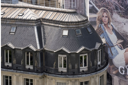
urbainable – stadthaltig Paris, 2017

Press images are provided free of charge solely for the current coverage of the exhibition. The images may neither be modified, cropped or overprinted. Any such changes to the images are only possible with prior permission in writing. Publishing on social media platforms and transfers to a third-party are not permitted. Press images are to be deleted from all online media four weeks after an exhibition has ended. Specimen copies are requested and should be sent unsolicited to the Press Office. For login details for downloads please contact +49 (0)30 200 57-1514 or send an e-mail to presse@adk.de .